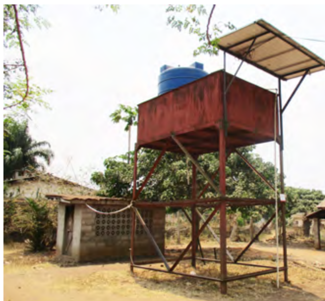
One of three solar powered wells providing water to the Tandala hospital

In 2015, we were able to raise enough money to provide five capped springs for communities this year!