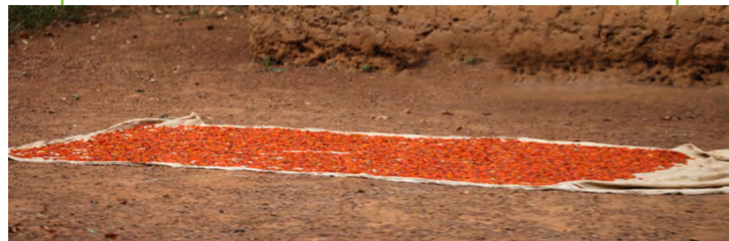
Seeds drying for the next planting season