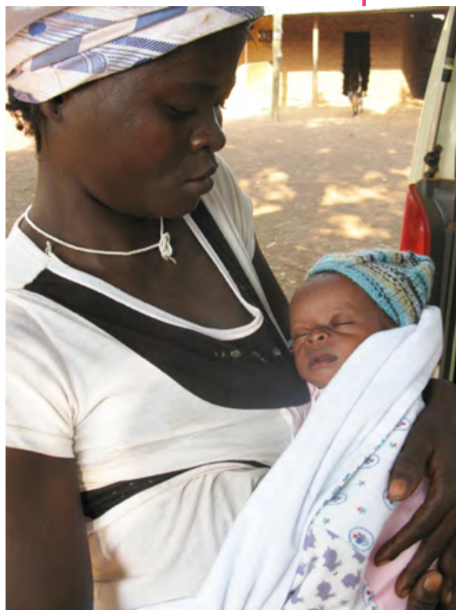
Above: The tiny baby in the story

I put a small skull cap hat on the baby and wrap him in a small blanket both made by a group of women in Brockville, Ontario, give her baby a kiss, and the woman thanks me with a kiss on my hand and walks away clutching the medicine. I think of my healthy infant grandsons in Canada receiving unbelievable medical care and pray that this tiny baby boy survives to reach the potential that God has for his life.