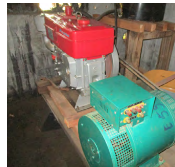
A generator installed to provide much needed electricity and water to the hospital.