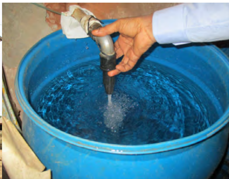
Running water in the Tandala hospital