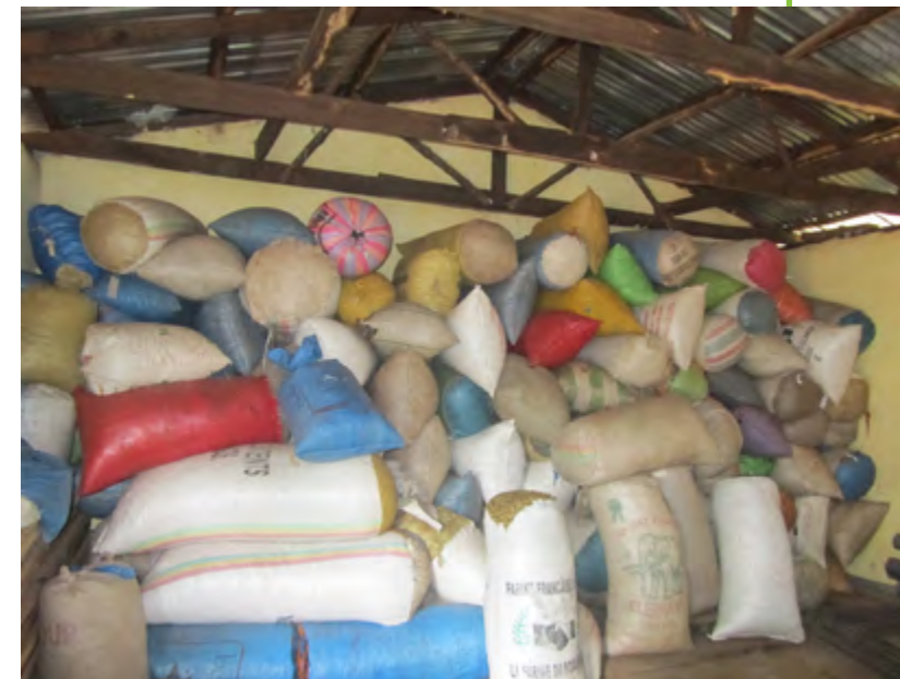
Seeds put into storage for the next planting season

Rice is a staple food in Sierra Leone and the groundnut program was so successful, we have now begun a rice seed loan program. In 2015 there were 18 farmers that benefited from this program and with their seed payback we will be able to assist additional farmers in the upcoming planting season.