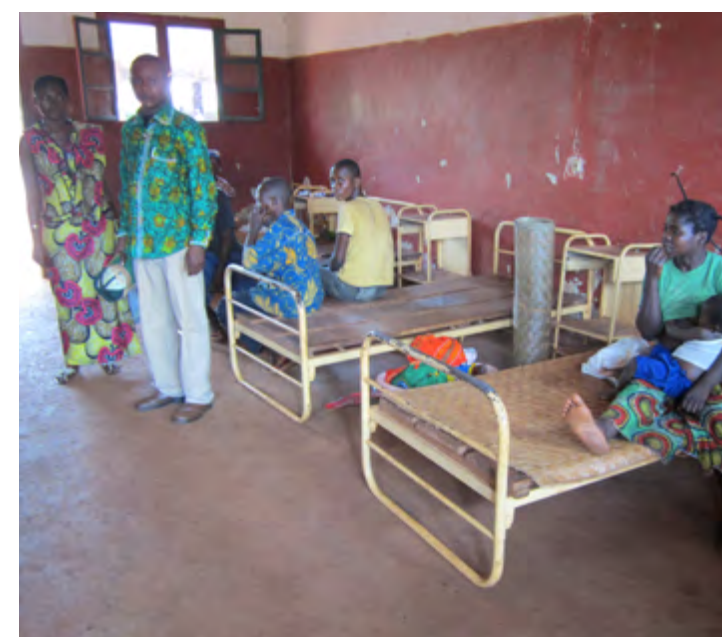
A typical hospital room in the Tandala Hospital.