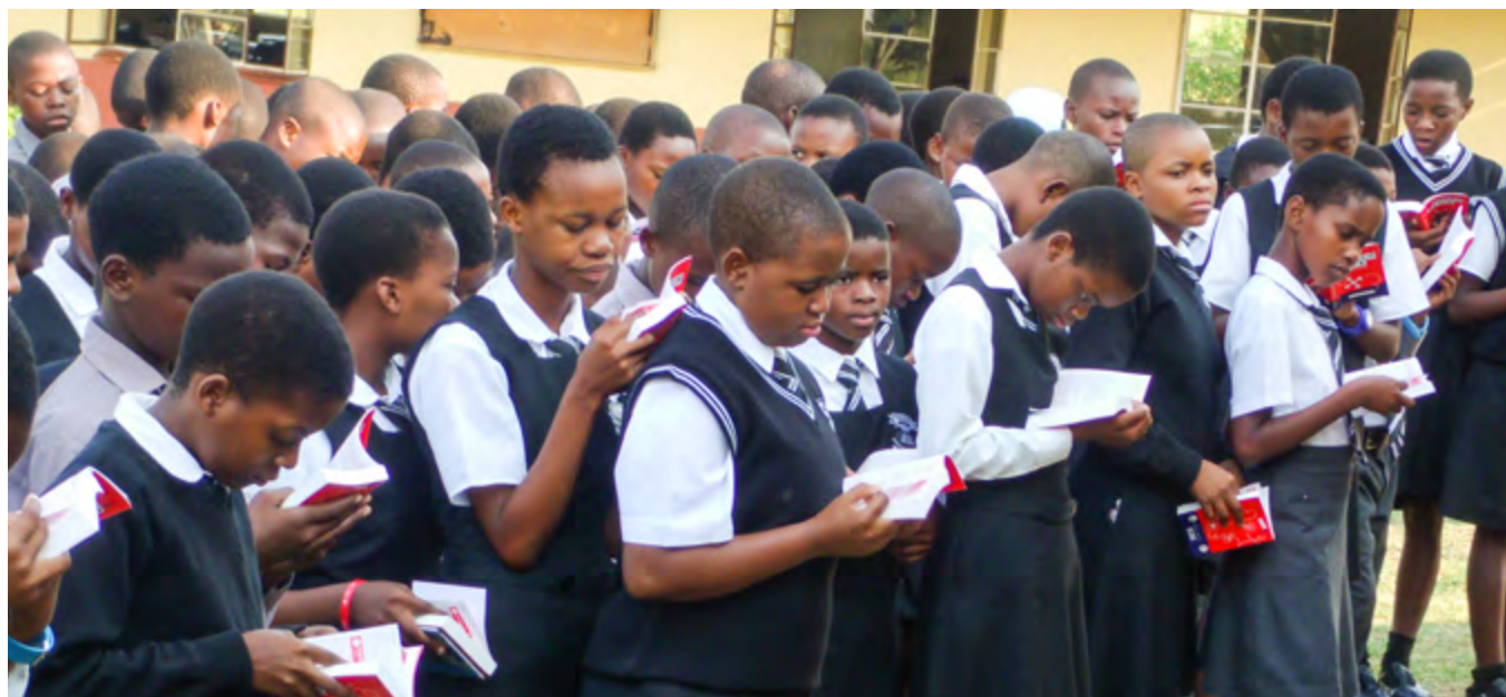
Students reading their Reach4Life bibles in Swaziland

"I finally realized that the devil has been playing with my mind all along and the Holy Spirit has been talking to me about my habits and I finally accepted Jesus into my heart."