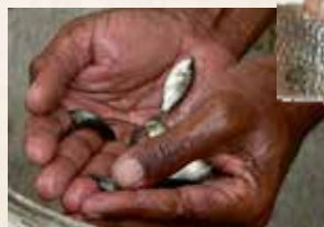
Fingerlings ready to be put into the pond.

World Hope Canada’s Fish For Hope project has been providing support to the fish farming sector in the northwest province of Equateur, Democratic Republic of the Congo since the fall of 2012. Through updated training, small tool subsidies, and extension support, the objective has been to revitalize a food production method previously proven to be very valuable in this region, but left unsupported and thus depleted for twenty years.