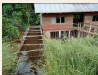
Water channel to the turbine