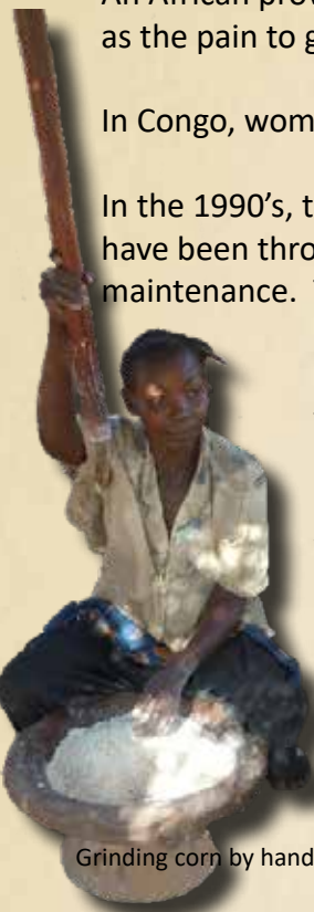
Grinding corn by hand

Each mill serves hundreds of people and saves a woman up ten hours per week of back breaking work. This frees up women to have time to focus on other important duties. The mill owner receives a portion of the produce he processes in payment. ♪