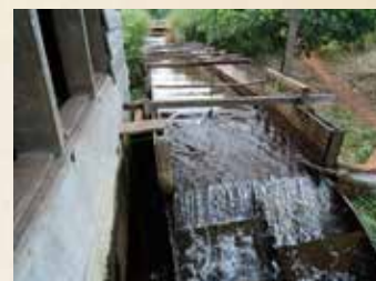
Water in the turbine