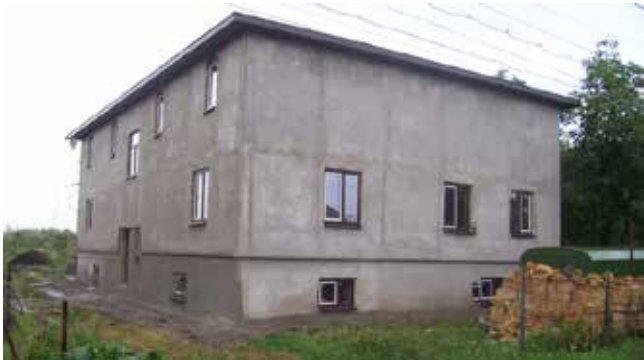
Hope House II Construction - 2014