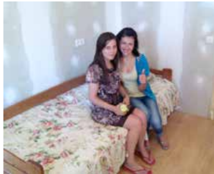
Girls at Hope House II with the new twin beds.