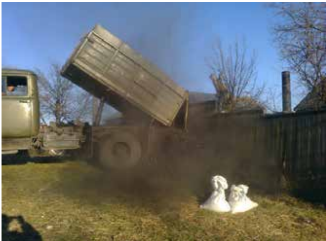
With your help, we delivered coal to the refugees in Donetsk.