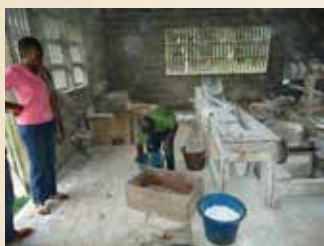
Flour mill inaction